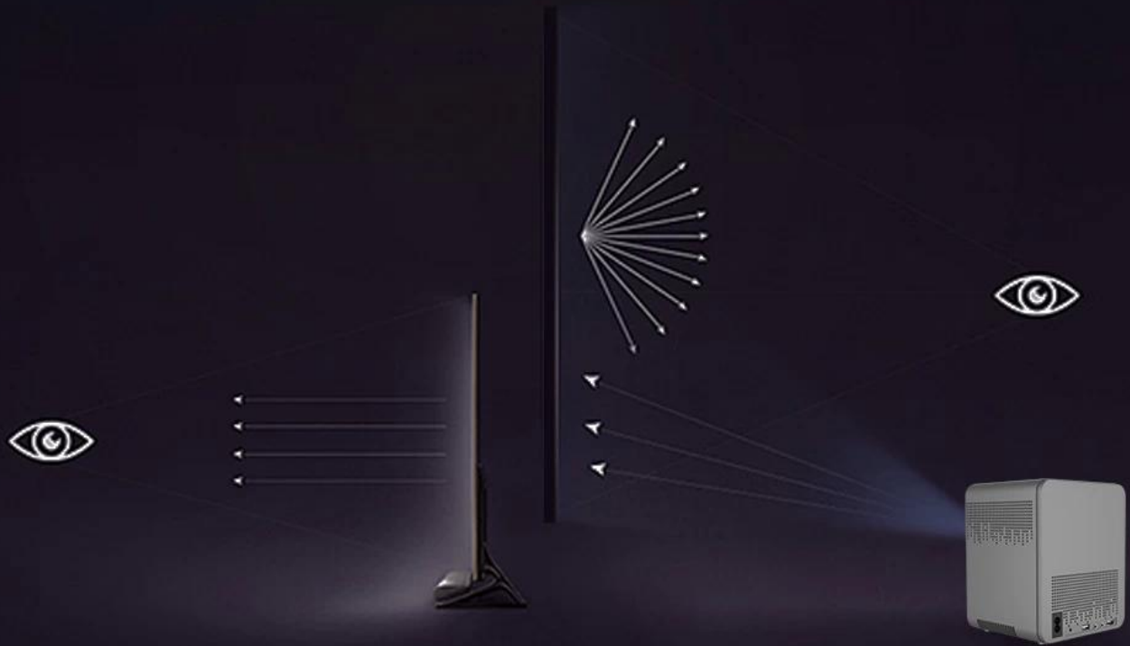
Traditional LCD TV

Reduce eye irritation, children watching movies healthier.