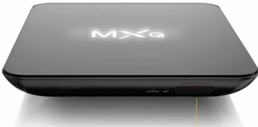
Indicator Light Port