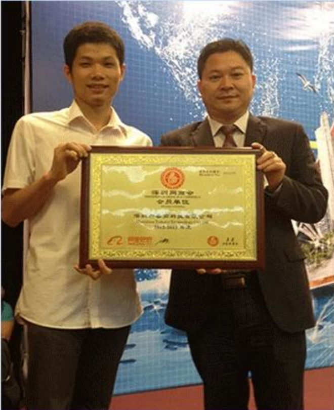
A member of the Shenzhen chamber of Commerce Network