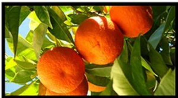
HD2.0 Image output