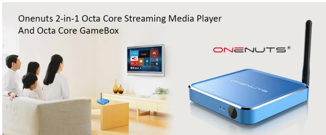
Onenuts 2-in-1 Octa Core Streaming Media Player And Octa Core GameBox