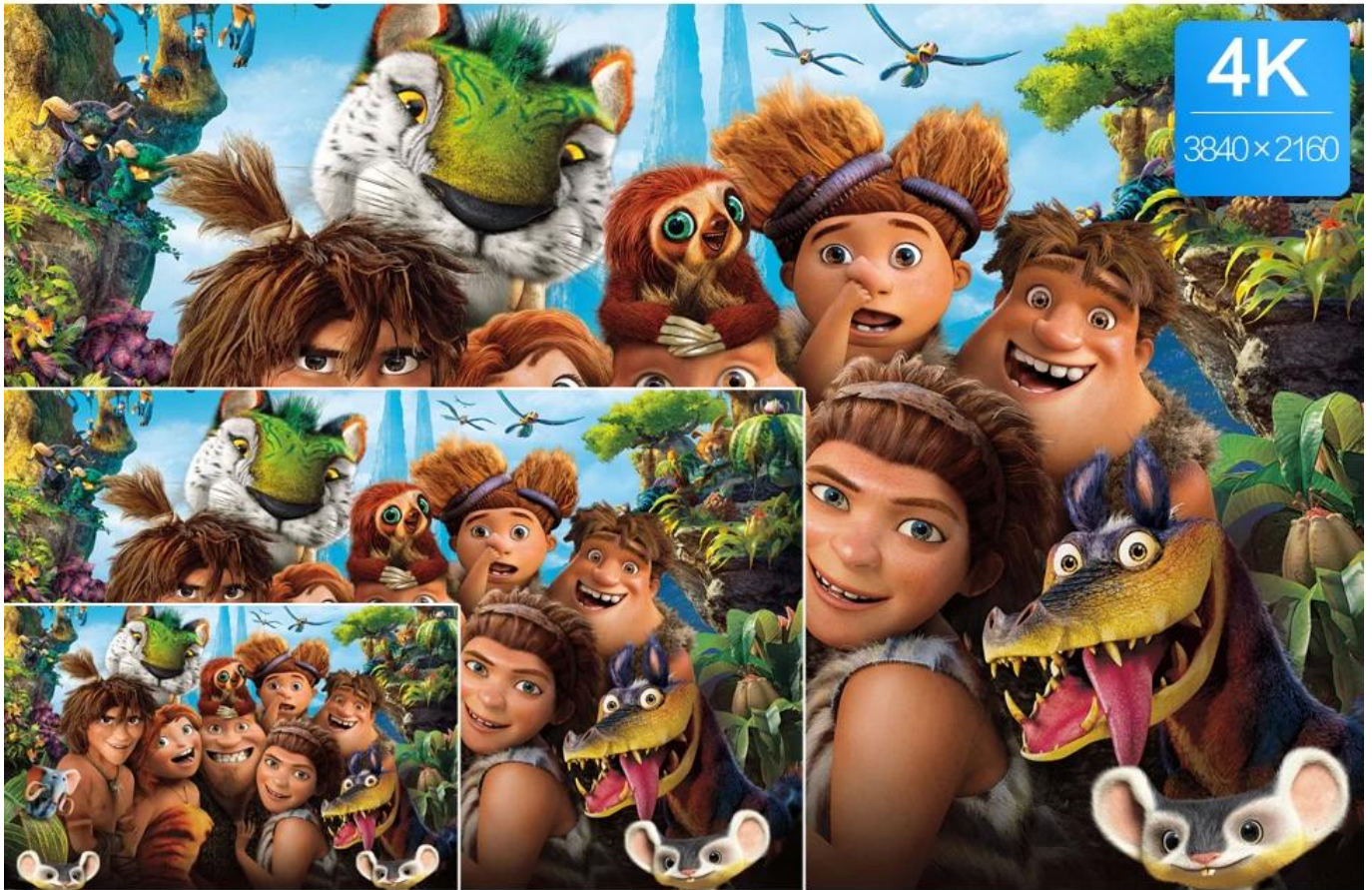
720P 1280 × 720

4K HD Video output, HRCT reach 3840x2160 pixel. 4 times of 1080P videos. Bring you immersive audio and visual experience