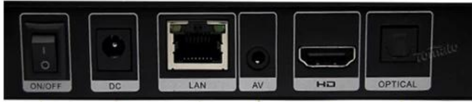
ON/OFF Button DC Port RJ45 ETHERENT AV Port HDMI™ OPTICAL Port