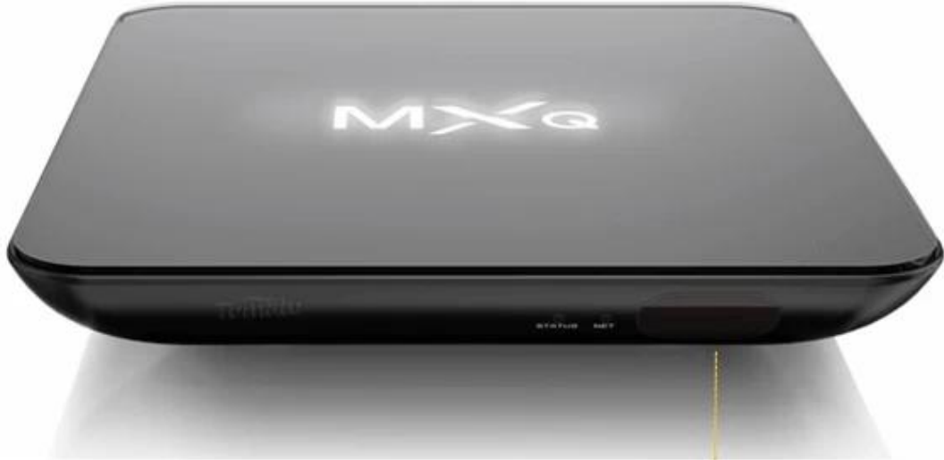
Indicator Light Port