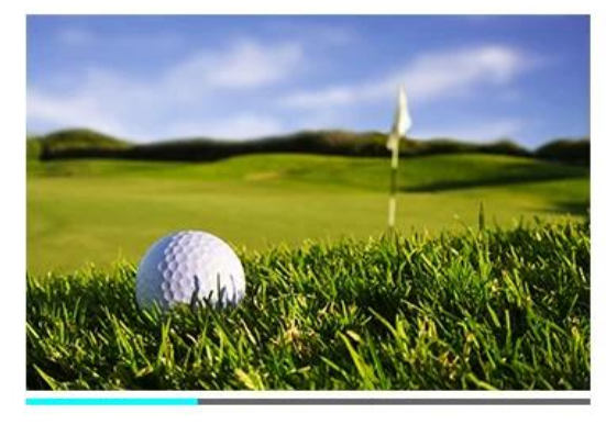
H.265 Decoding Less bandwicth / clearer image