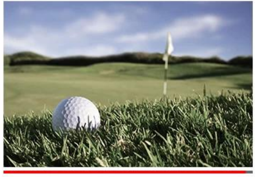
Not decoded Loading slowly / blurred image