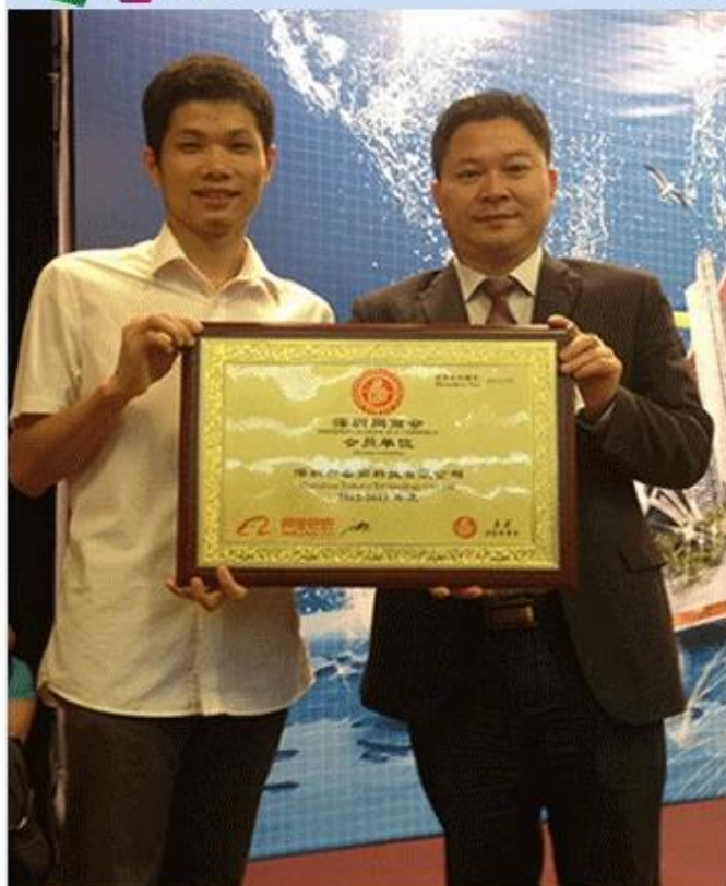
A member of the Shenzhen chamber of Commerce Network