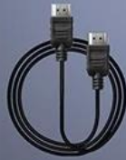
HD data cable*1