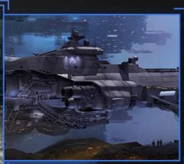
Super clear movie