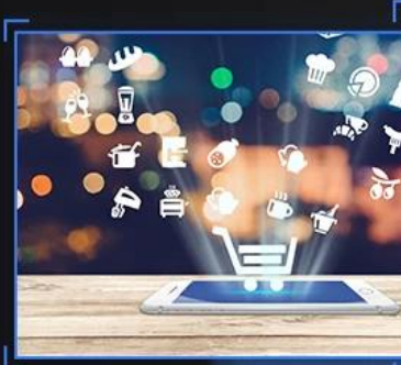
Extreme speed internet