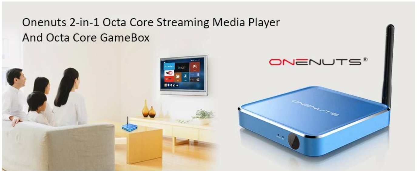
Onenuts 2-in-1 Octa Core Streaming Media Player And Octa Core GameBox