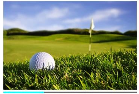
H.265 Decoding Less bandwicth / clearer image