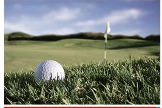
Not decoded Loading slowly / blurred image