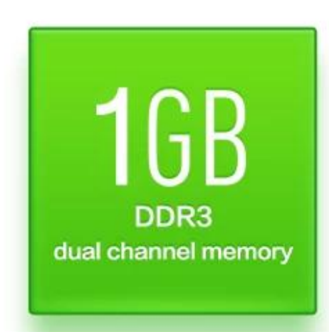
It's all about speeding up.