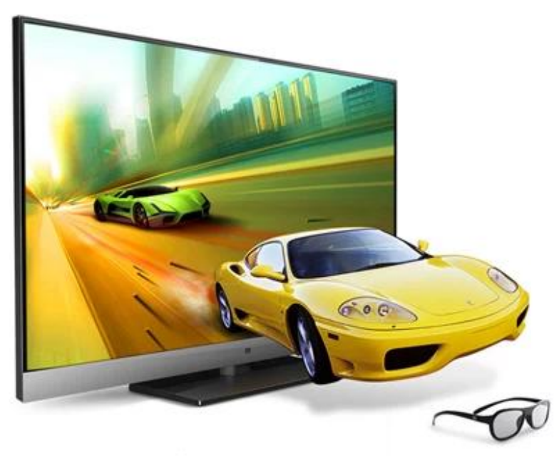
Experience home entertainment in 3D!