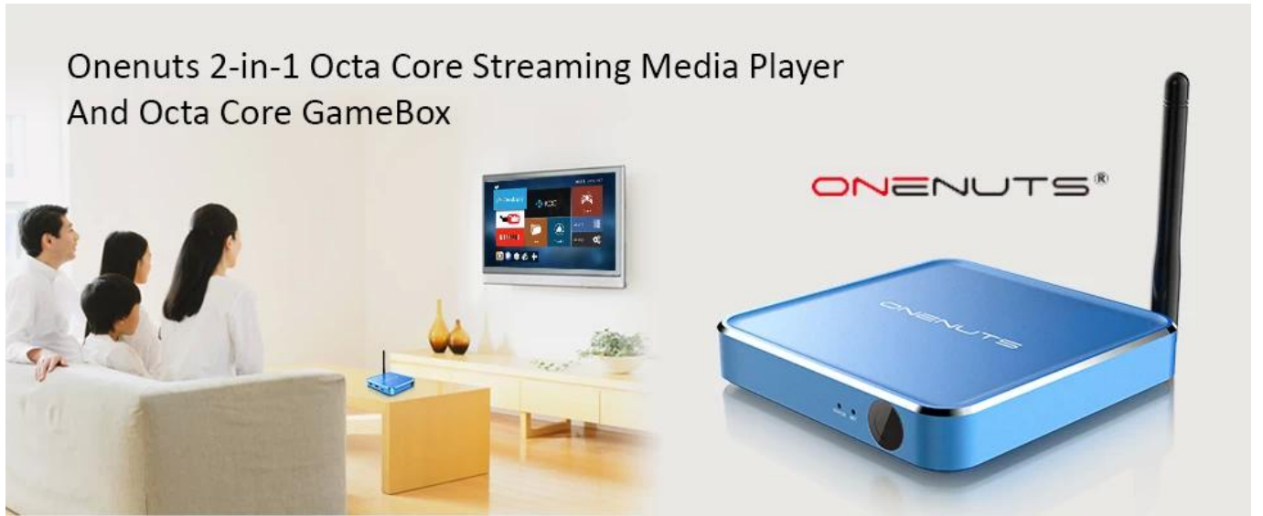
Onenuts 2-in-1 Octa Core Streaming Media Player And Octa Core GameBox